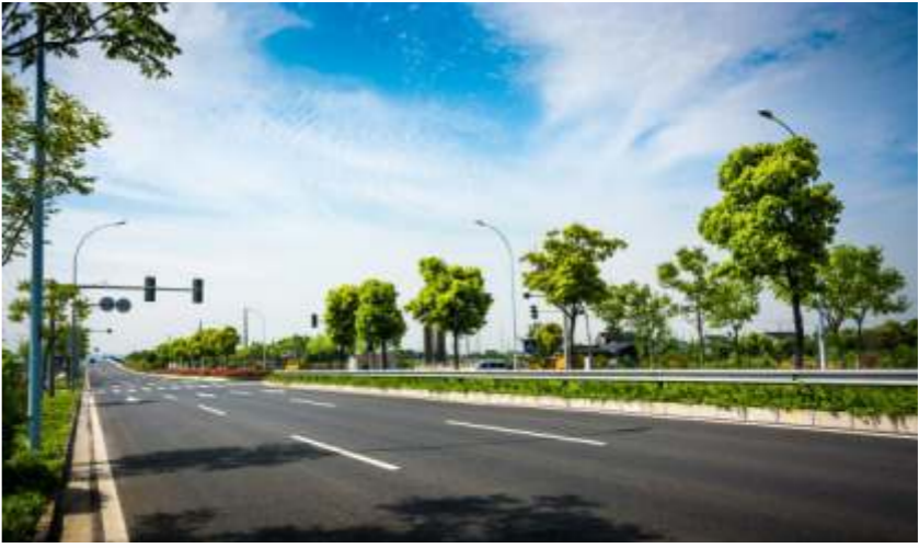
5 Mins from Bengaluru Highway Facing Regional Ring Road as per HMDA Masterplan

Marigold Meadows will be an address of aspiration – a community that truly sets the benchmark for other neighbourhoods in the surrounding areas.