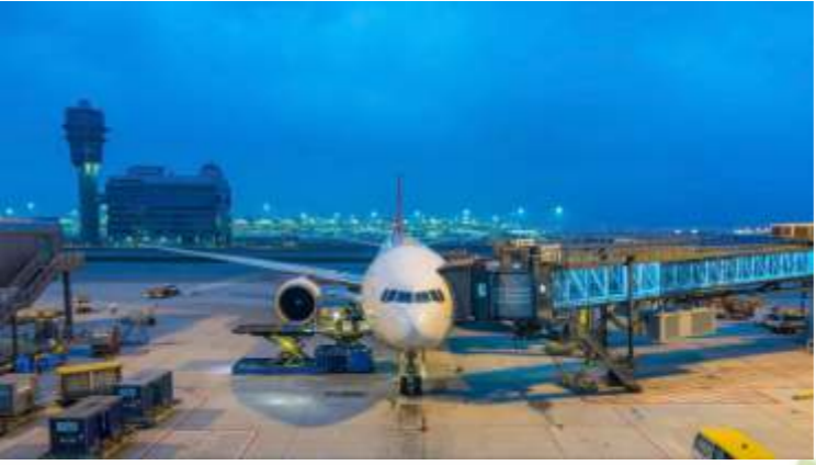
28 kms from Shamshabad ORR exit