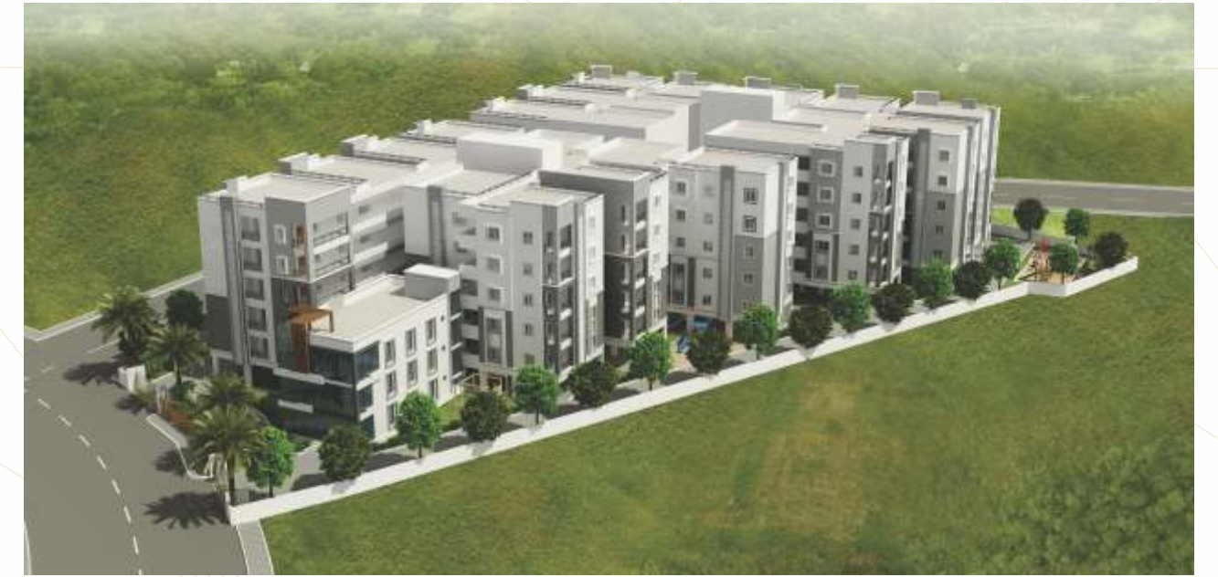
Birds Eye View of Marvella